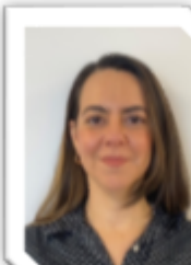
Marlone Gonzaga W506 Ergonomics Essentials or OHTA other courses: OHTA